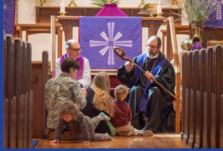
Easter Vigil 2024