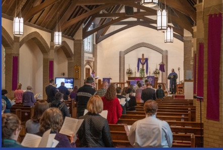
Palm Sunday 2024